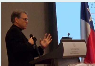
Rick Perry— former Texas Governor